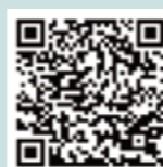
Detailed programme outline